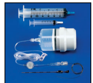
Pain Control Device