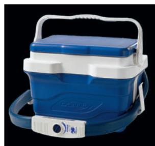
Iceman Cold Therapy System