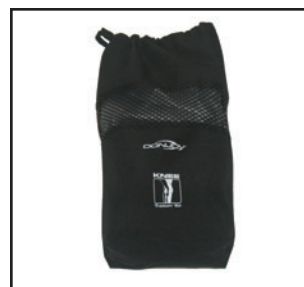
Flex Knee Therapy Kit