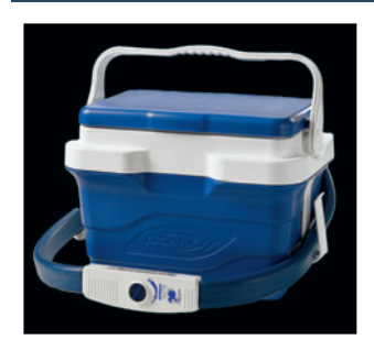
Iceman Cold Therapy System