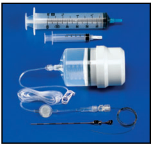
Pain Control Device