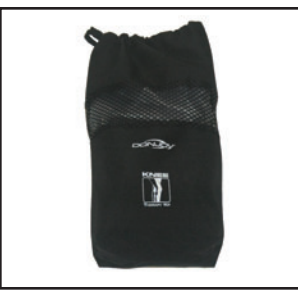
Flex Knee Therapy Kit